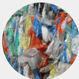
PP PLASTIC FILM

GMC Heavy Duty Granulators are designed for high throughput size reduction of larger sized products in a single pass. These machines are specifically designed for treating plastic film or PP big bag material of high contamination. Incorporating various different methods of wear protection such as replaceable wear plates and resistant surface coatings, the GMC machines are well suited to processing abrasive, contaminated materials such as glass filled plastics and dirty films containing sands.