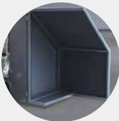
Sound Proof Enclosure