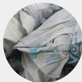
PP WOVEN BAG