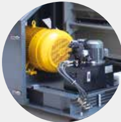
Hydraulic Opening Device